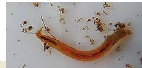
red chironomid larva