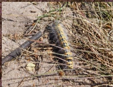
Caterpillar of Great White cabbage butterfly